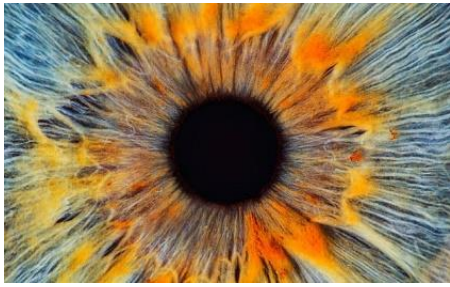
Human eye close up

Book repair busy bee - St L kitchen: Tues 3pm